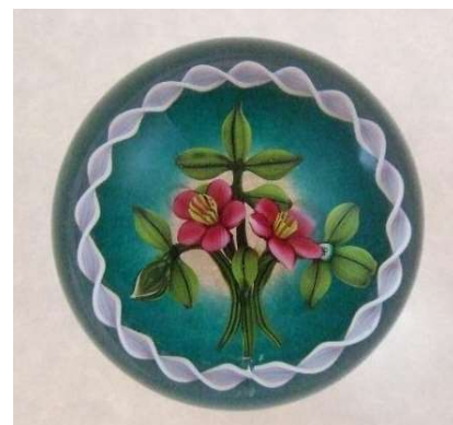
Parsley American Quilt with Torsade